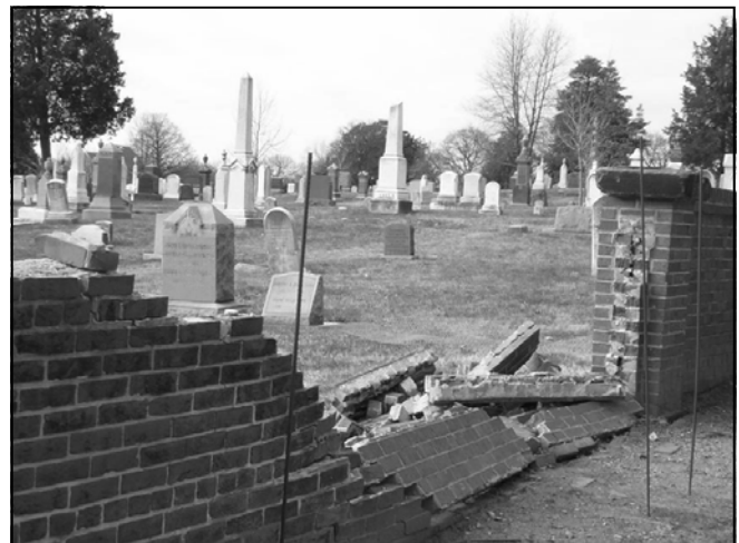
Brick wall damaged by motorist

Mon. May 31st—Memorial Day Flag placements at veterans' gravesites