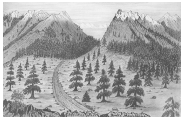
Cherokee Pass on the “Trail of Tears.”